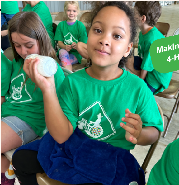
Making butter at 4-H AG Day!

Hey there, 4-H fans! This month we're thankful to work with awesome leaders and young people like you! Please check the enclosed calendar for upcoming events and activities this month.