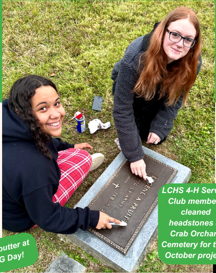
LCHS 4-H Service Club members cleaned headstones at Crab Orchard Cemetery for their October project.

Included in this newsletter is the 2024 4-H Country Ham Contract. These are due, along with $70 payment, by Friday, December 8. Remember, we have our own ham curing barn right here in Lincoln County. Please check out the included information to sign up for this awesome project. Adults are also able to cure a ham, just give us a call.